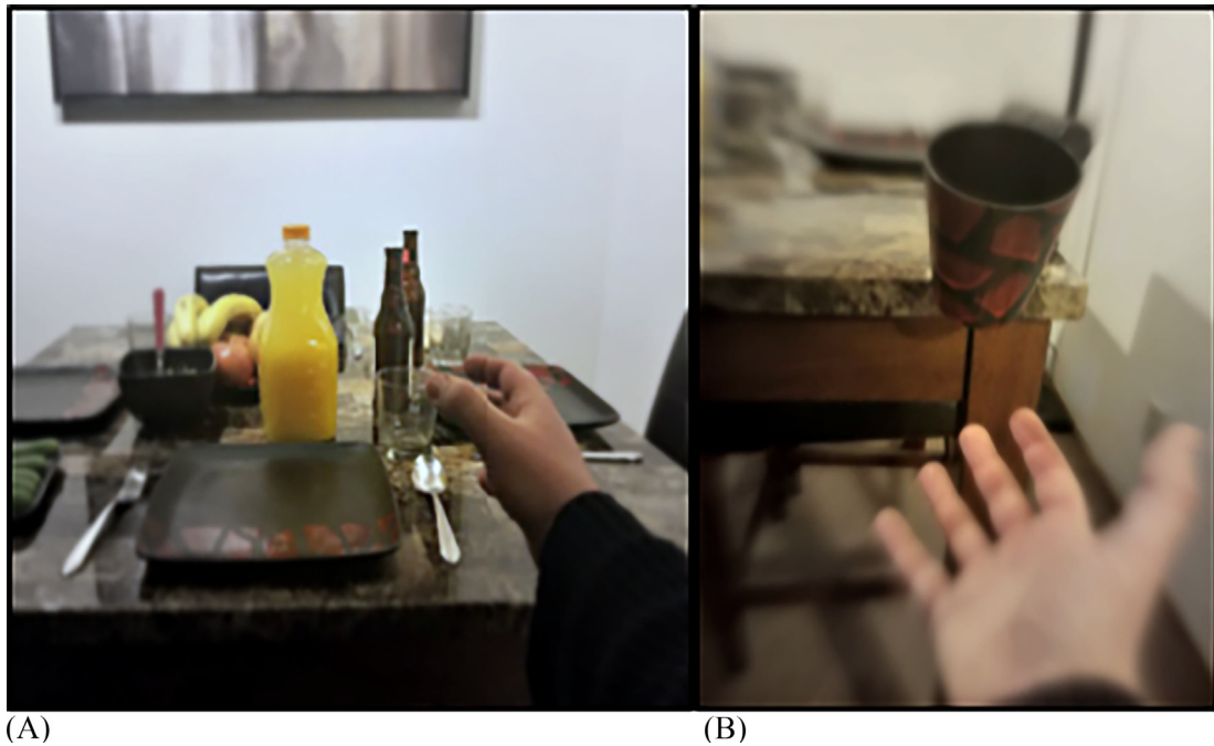
Fig. 1. The Dorsal Stream in Action. (A). Consider the challenges of performing a simple visuomotor task, such as pouring orange juice from a bottle on the table, into a glass. The observer must determine the location, distance, and size of the object relative to himself. Initiating a reach towards the object involves constant monitoring and updating of hand position to avoid knocking over other objects (i.e., obstacles) that may be in the way. He must also determine the 3-D geometric structure of the object, so that the fingers can be shaped appropriately to match the anticipated contact site. To do pour contents from (rather than simply move) the bottle effectively, he needs to apply a grip force that is commensurate with the object's shape and weight. This weight estimate presumably requires information about the object's size and material properties – information that needs to be recalibrated on-the-fly, given that the object's weight will change as liquid moves from the bottle to the glass. (B). These computations become even more complex when the objects we wish to interact with are in motion. For example, we may notice a cup falling from the table, and instinctively reach to grasp it. This action requires many of the dynamic computations described above (i.e., reaching in the right direction and adjusting the fingers to match the object's shape), but now they must be applied to an object whose spatial position and distance from the observer are changing rapidly. Both 3-D structure, and form-motion integration, are required to interact with objects in dynamic real-world contexts. (For interpretation of the references to colour in this figure legend, the reader is referred to the web version of this article.)

properties are processed in the dorsal pathway, some have argued that dorsal cortex is critically involved in processing 3-D geometric shape information, such as surface curvature, size, and location relative to the observer (Farivar, 2009; Freud et al., 2016; Janssen, Verhoef, & Premereur, 2018; Orban, 2011). A separate branch of research has focused on the involvement of dorsal cortex in motion processing and form-motion interactions (Galletti & Fattori, 2018; McCarthy, Erlikhman, & Caplovitz, 2017). In the sections below, we relate research outcomes in 3-D shape representation and form-motion integration in dorsal cortex, with respect to their contribution to action-related object processing. We also revisit the ways in which dorsal object processes differ in fundamental ways from the known properties of object areas along the ventral processing stream (DeYoe & Essen, 1988; Goodale & Milner, 1992). A synthesis of recent research in each of these domains will foster a more complete understanding of the nature of object processing in the dorsal visual stream, and serve as a guide to future research in the field.